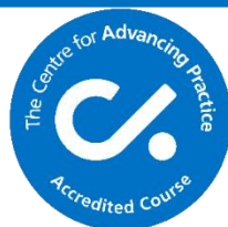
Celebrating our Higher Education Institutes